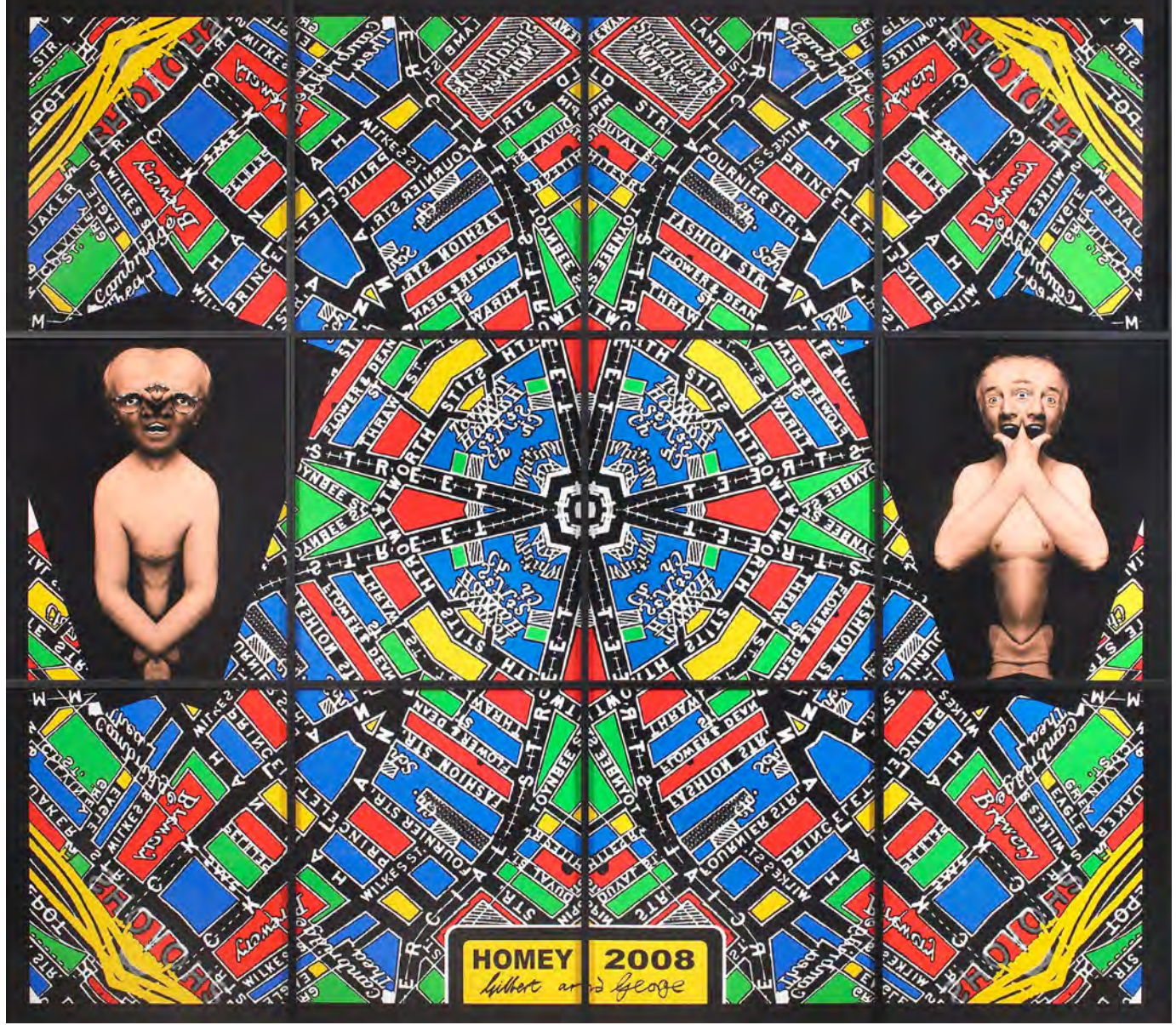
Gilbert & George, Homey, 2008. Mixed media, 89" x 100"

Front page: Hiroshi Sugimoto, Fifth Avenue Theatre, Seattle , 1997, gelatin silver print, 20" x 24" Page 2-3: Ruud van Empel, Generation , 2010, chromogenic print, Dibond, Plexiglass, 49 3/16" x 129 15/16" Back page: Erwin Olaf, Dusk-The Mother , 2009, lambda print on Kodak Endura, 29 1/8" x 55 1/2"